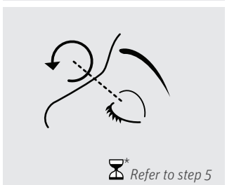
{\overline{ {f X}}}^* Refer to instructions for waiting time